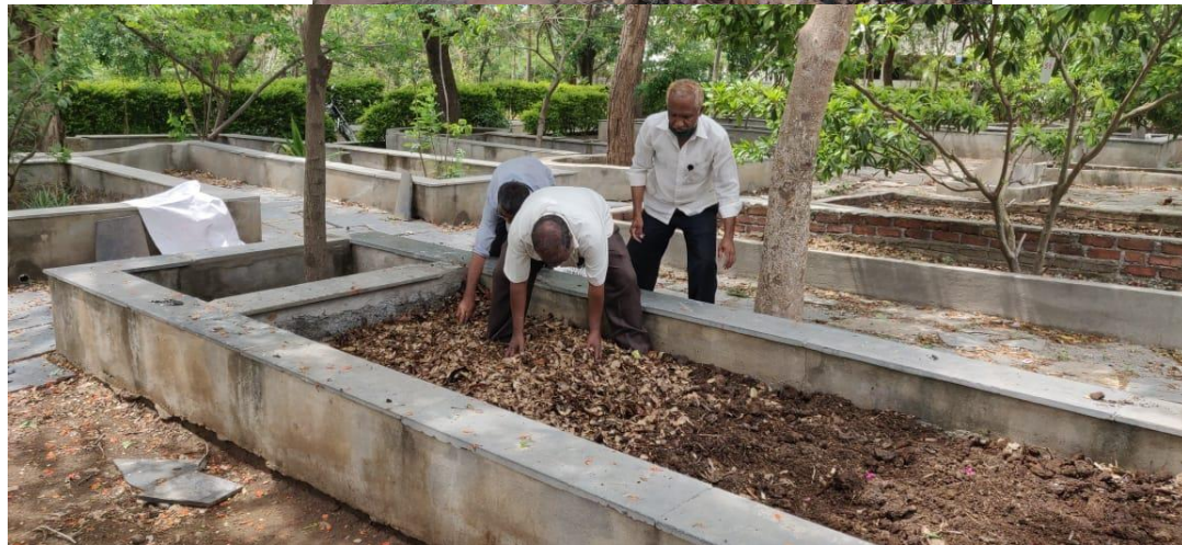
Preparation of bed for vermin-composting