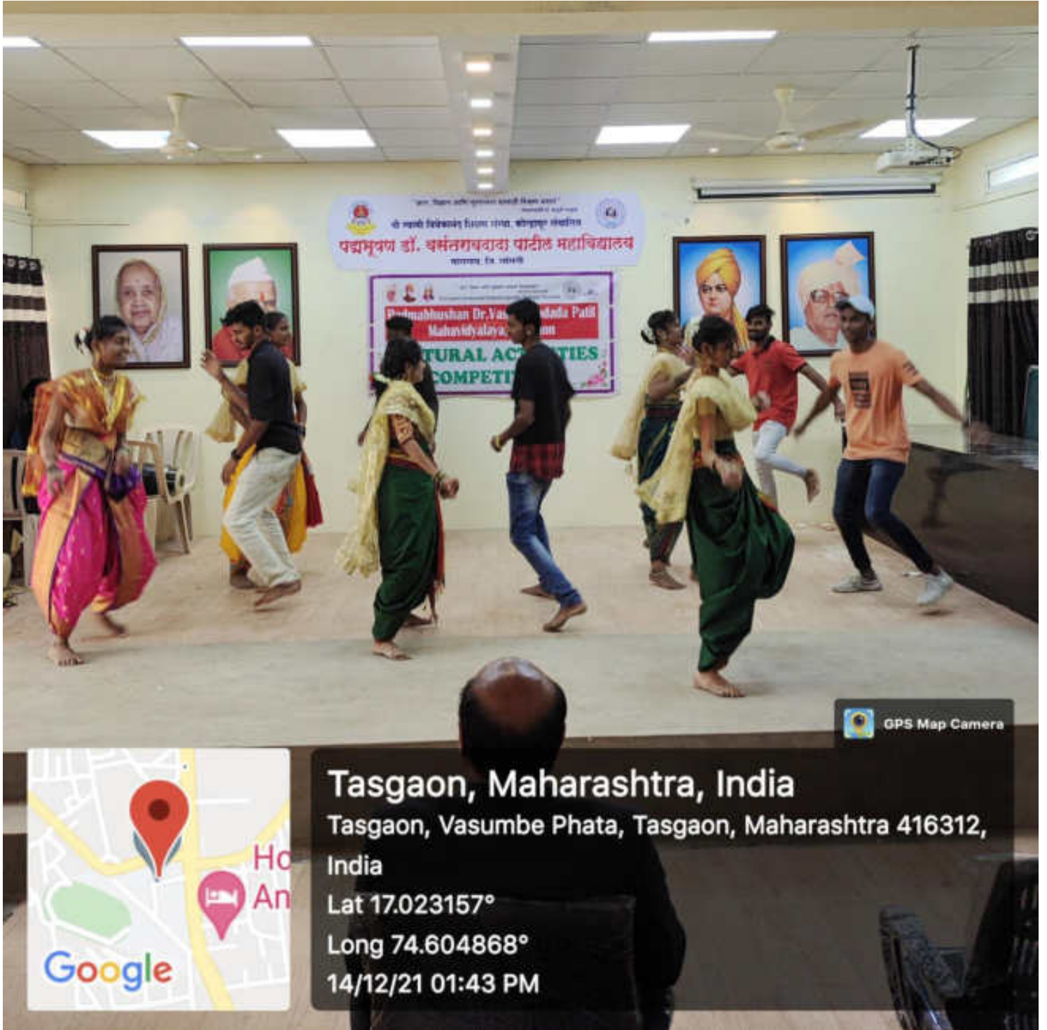
Closed Stage for Cultural Practice and Competition