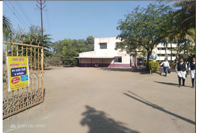
No Vehicle Day Place – Main Campus Road