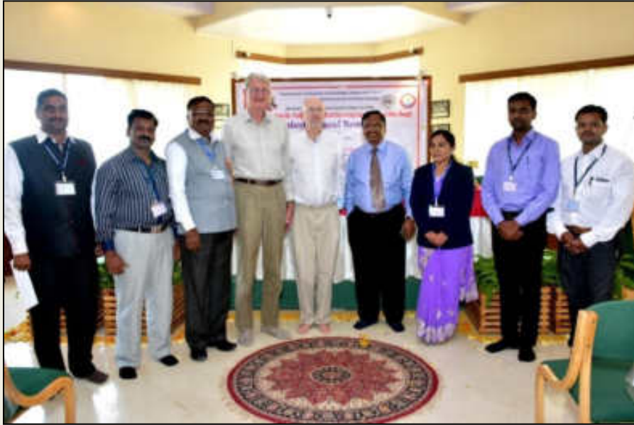
With Foreign Dignitaries