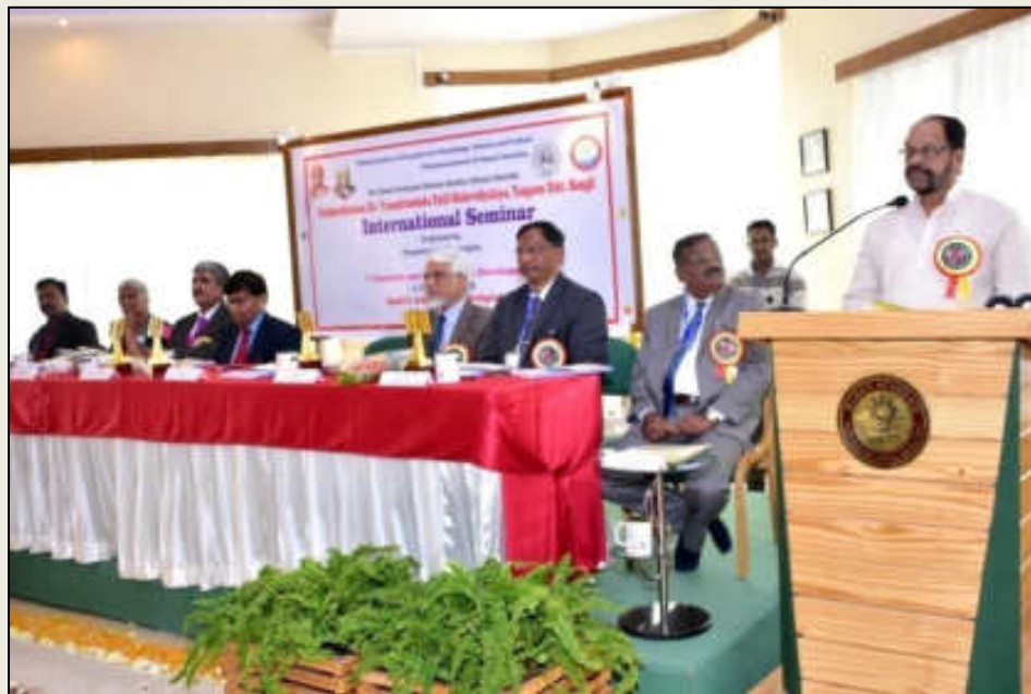
Inaugural Address by –Hon. Prin. Abhaykumar Salunkhe