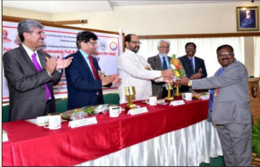
Felicitation of Organizing Committee