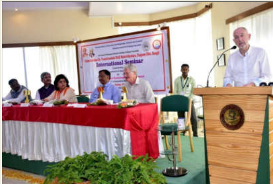
Chief Guest Valedictory Function