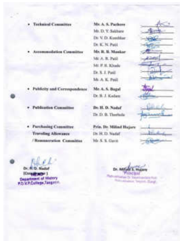
Seminar Work distribution Committee