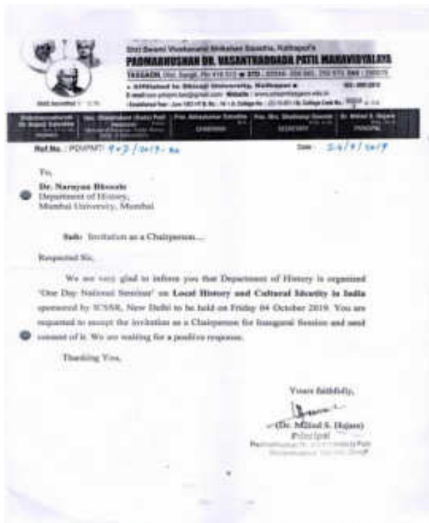
Guest Invitation and Appreciation letters