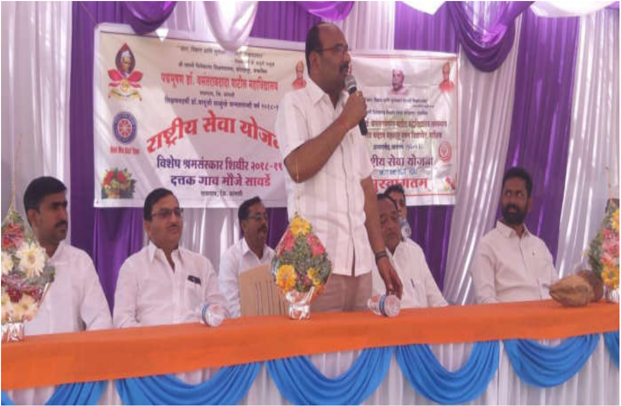
GREETINGS BY HON.MR.SANJAY (KAKA) PATIL M.P.,SANGLI CONSTITUENCY