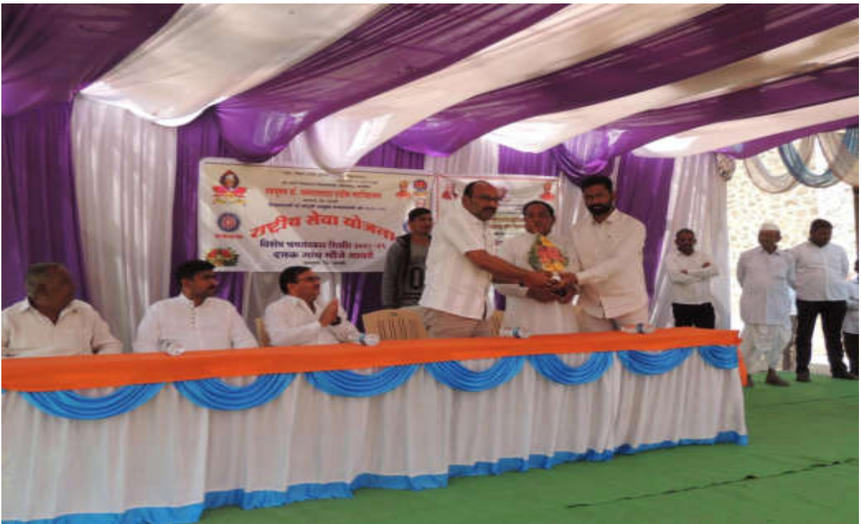
HON.MR.SANJAY (KAKA) PATIL M.P.,SANGLI CONSTITUENCY