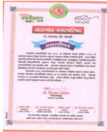
Participation Certificate of 'Swatch Bharat Abhiyan' from Tasgaon Municipal Corporation