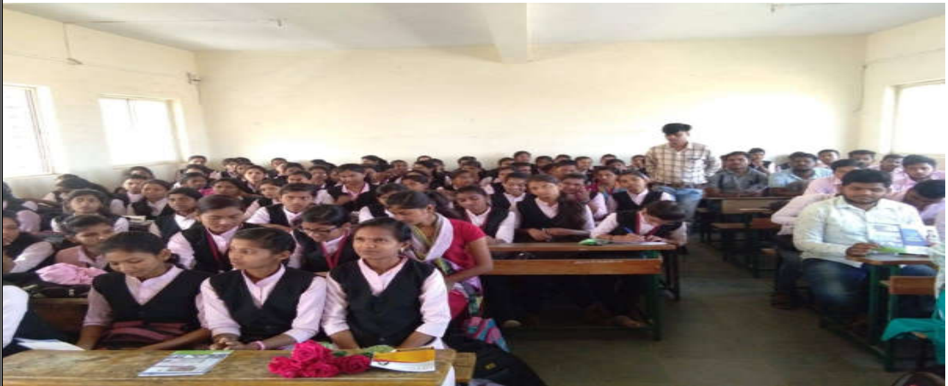
Students attending the workshop