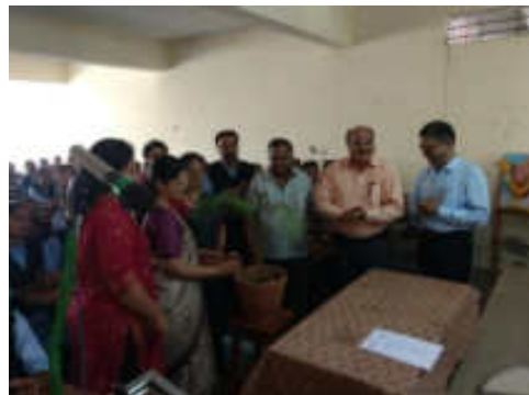
Inauguration of the One Day Workshop on Gardening