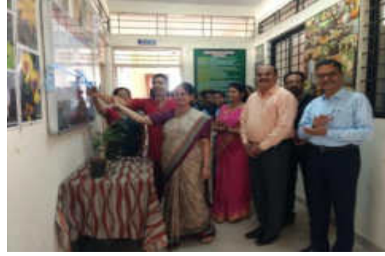
Inauguration of the Know Our Plant Best Practice of the Department