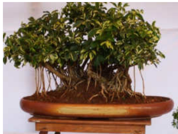
Bonsai of Rubber Plant