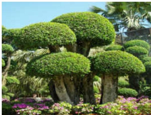
Bonsai of Ficus Plant