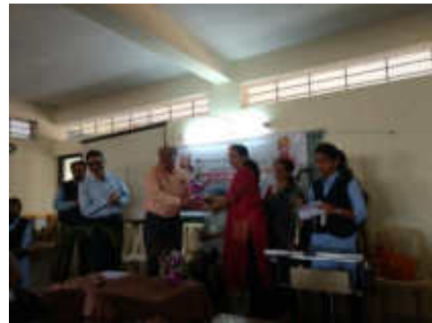
Felicitation of Resource Persons