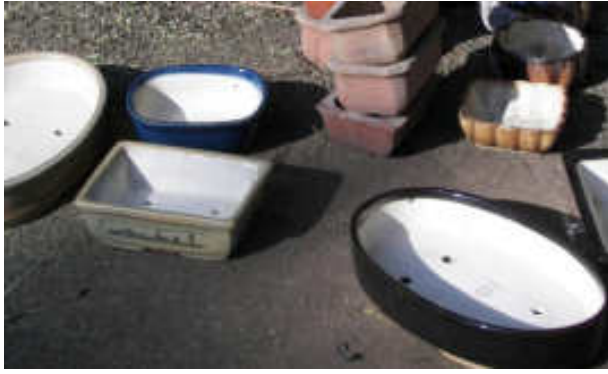
Pots used for Bonsai Preparation