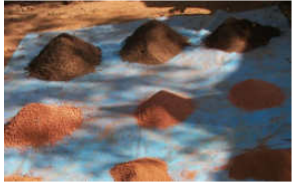
Soil prepared for Bonsai Preparation