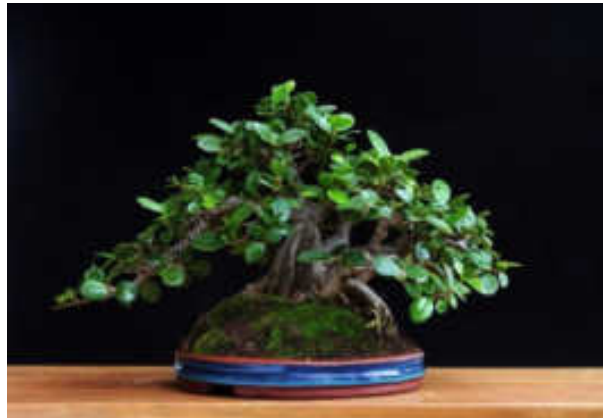
Bonsai of Ficus Plant