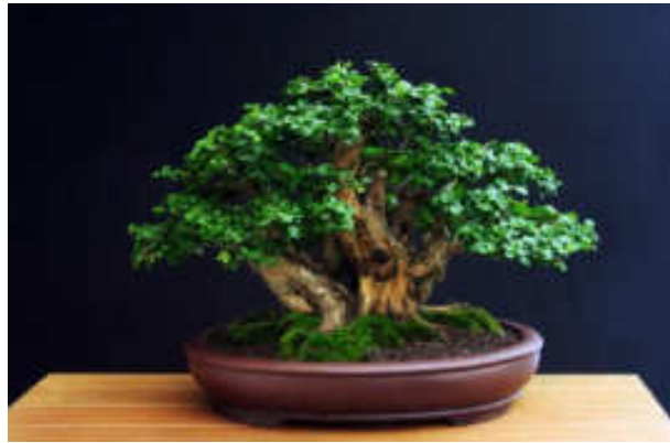
Bonsai of Stone Plant