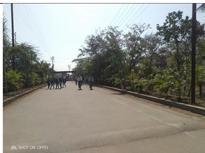
Students entering in College Campus by walk & By cycle