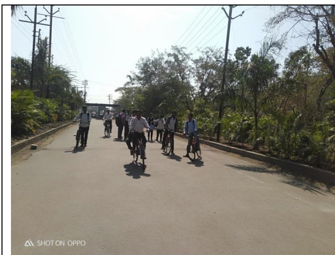
Staff and Students coming with By cycle