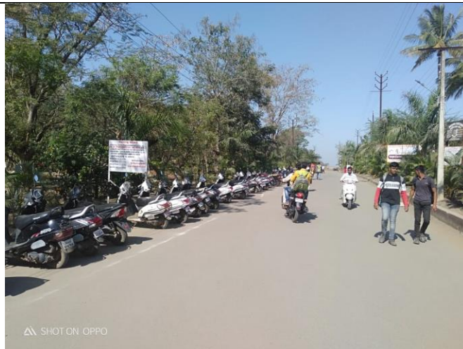
Motor Cycle - Main Campus Road Parking Place For Students