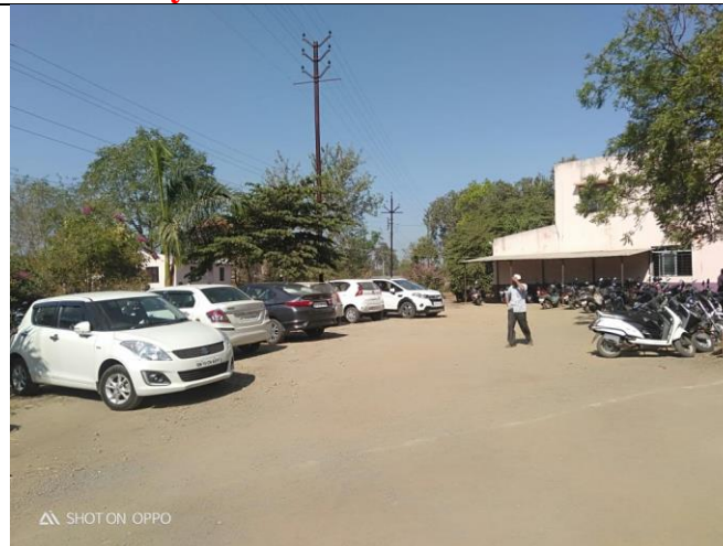
Car & Motor Cycle Parking Place of Staff