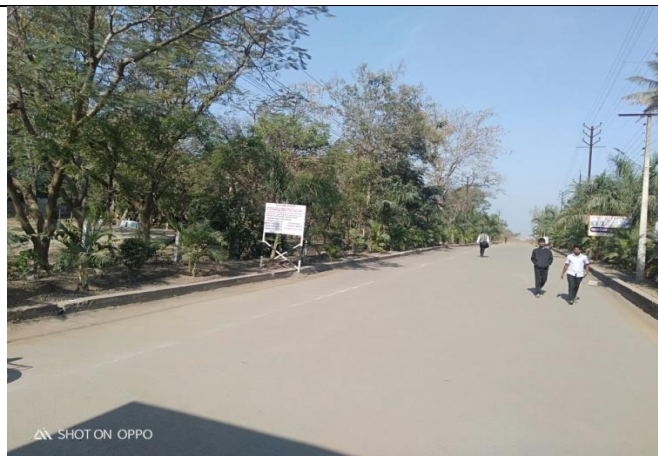
No Vehicle Day Place – Main Campus Road