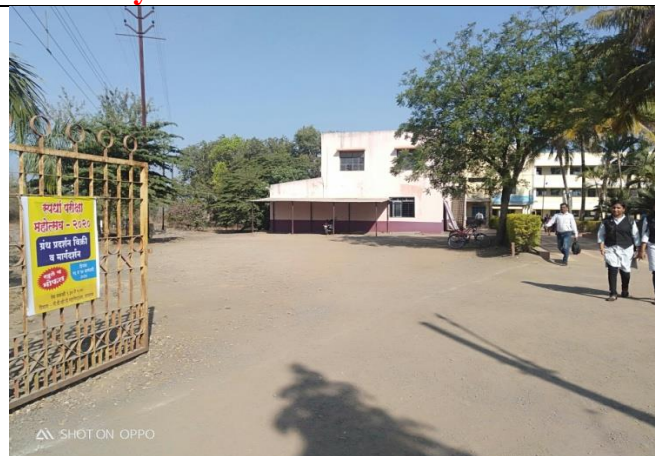
No Vehicle Day – Main Car Parking Place