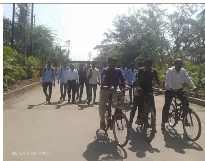
Staff and Students coming with By cycle