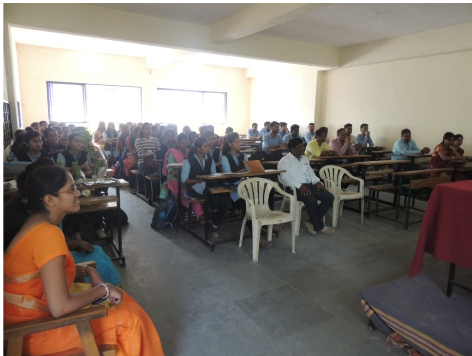
One Day workshop- vermicompositing Biotechnology- Participants Teachers and Students.