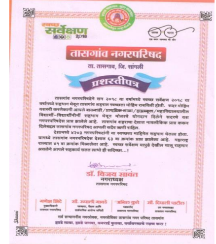
Participation Certificate of 'Swatch Bharat Abhiyan' from Tasgaon Municipal Corporation