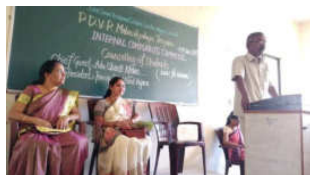
Vice Principal guiding the students