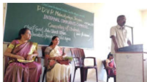
Vice Principal guiding the students